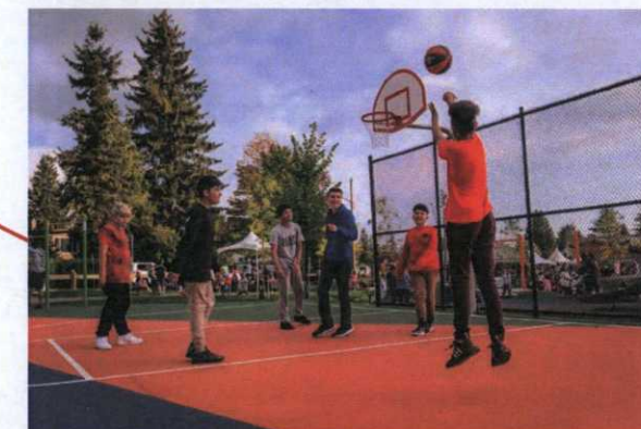
Multi-Use Sport Court